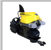
Automation CoPilot RI by Seebyte