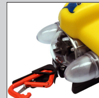
Recovery and Retrieval Tool Kit