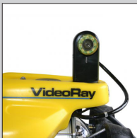
Auxillary Cameras Second POV GoPro