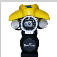
Sonar Blueprint Blueview (pictured) Tritech