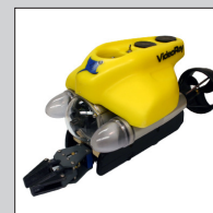
Manipulators Single Axis Rotating (pictured)