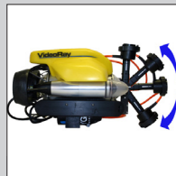
Non Destructive Testing (NDT) Ultrasonic Thickness (pictured) Cathodic Protection Radiation Probe