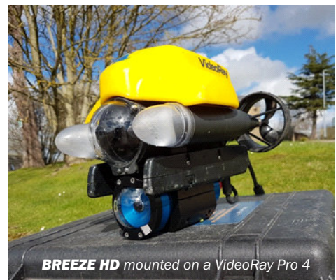
BREEZE HD mounted on a VideoRay Pro 4