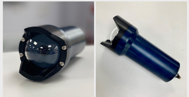
BREEZE HD from Atlantas Marine Ltd.