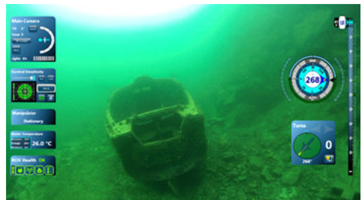
ROV pilot's view - BREEZE HD with VideoRay cockpit instruments